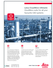
Leica CloudWorx Ultimate Data Sheet