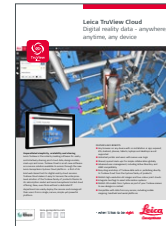
Leica TruView Cloud Flyer