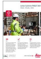
Leica Cyclone FIELD 360 Flyer