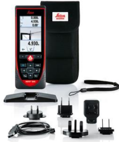
Leica DISTO™ S910 Art. No. 805080 Art. No. 808183 for U.S.

Leica DISTO™ S910, pouch, adapter for corner measurement, set-up plate for Smart Base, hand loop, USB charger, Calibration Certificate Silver, quick start guide