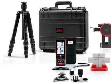
Leica DISTO™ S910 P2P package Art. No. 887900

Leica DISTO™ S910, pouch, adapter for corner measurement, set-up plate for Smart Base, hand loop, USB charger, Calibration Certificate Silver, quick start guide