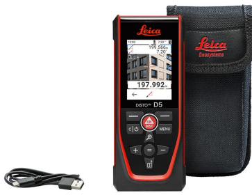
Leica DISTO™ D5 Art. No. 950908

Leica DISTO™ D5, Pouch, USB-C to USB-A Cable, Hand Loop, Quick Start Guide, Warranty card, Safety Manual, Calibration Certificate Silver